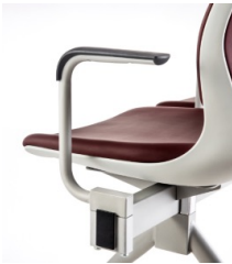
Fixed armrest only for V-shape base