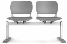
2 person W1175*D545*H820mm