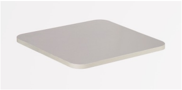
Laminated wood: 450*450*18mm