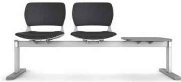
3 person W1735*D545*H820mm